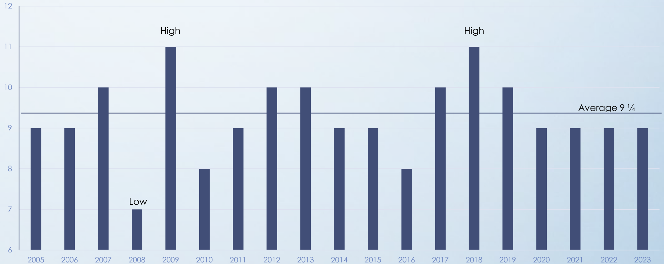
Meetings per Year